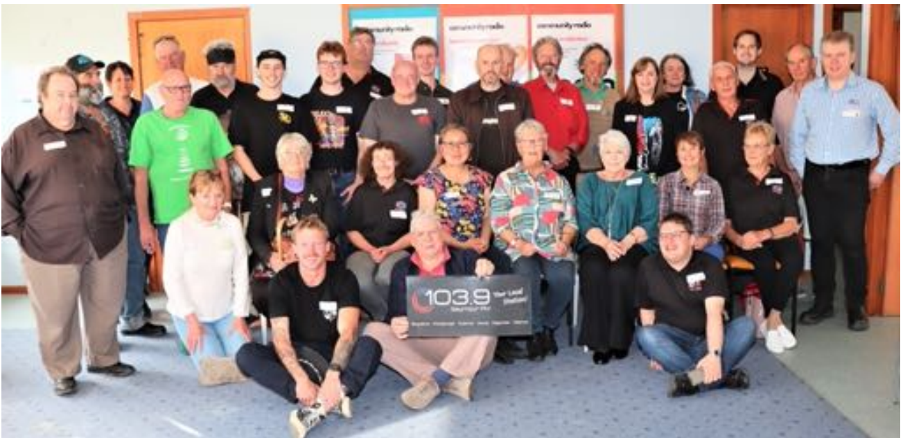
Pictured above: Attendees at the new Pollard St studios Christmas Party December 2021.